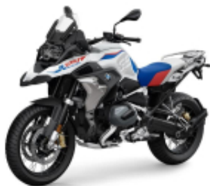
R 1250 GS Rally + $3,145.38