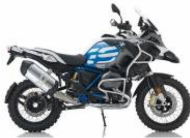
R 1200 GS Adv + $145.86