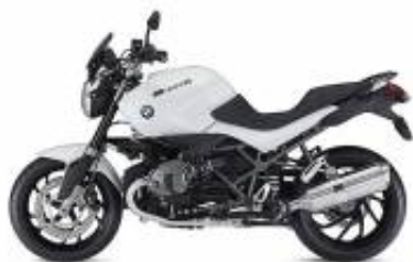
R 1200 R + $94.18