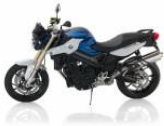
F 800 R + $94.18