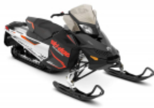
Bombardier 600 + $0.00