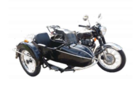
Classic 500 with Sidecar + $0.00