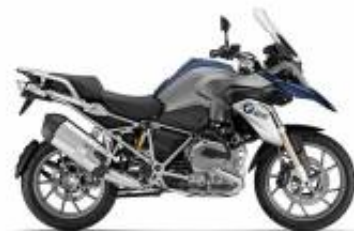
R 1200 GS + $290.27