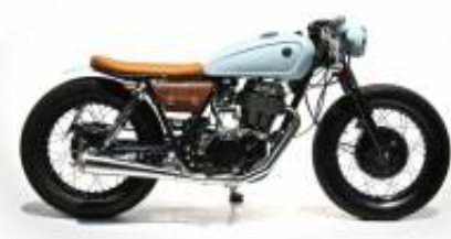
SR 250 Caferacer + $0.00