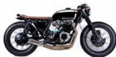
CB 500 Cafe Racer + $0.00