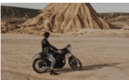
6 - Merzouga - Errachidia - 130