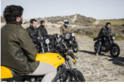
1 - Marrakesch - Marrakesch - 50