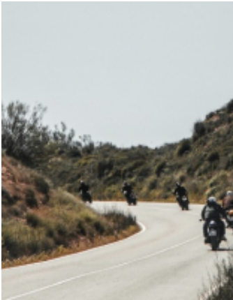
3 - Aït-Ben-Haddou - Dades - 190