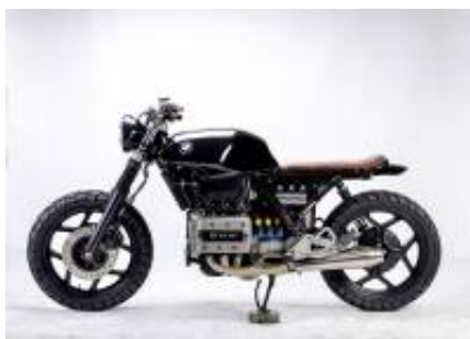
K75 Scrambler + $0.00