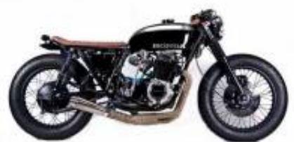
CB 500 Cafe Racer + $0.00