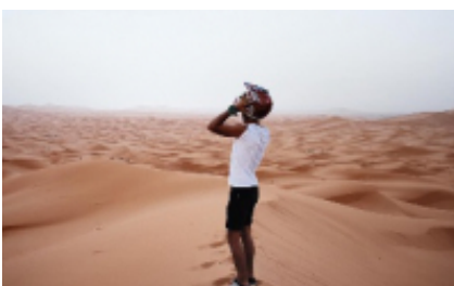
5 - Merzouga - Merzouga - 190