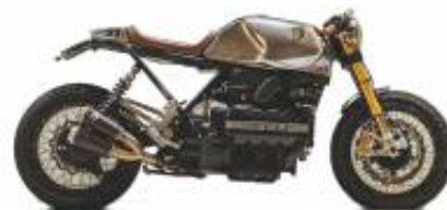
K 100 RS Caferacer + $0.00