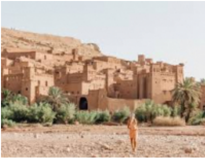
2 - Marrakesch - Aït-Ben-Haddou - 180