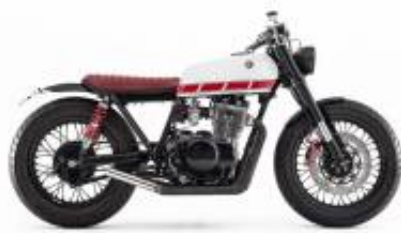
XS 400 + $0.00