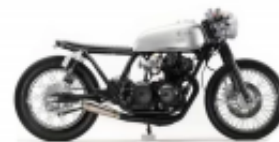
CB 250 Cafe Racer + $0.00