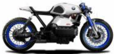
K75 Cafe Racer + $0.00