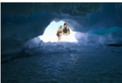
5 - Irkutsk - Irkutsk -