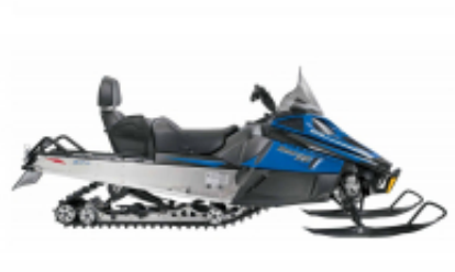
Bearcat XT + $0.00