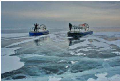
2 - Listwjanka - Listwjanka -