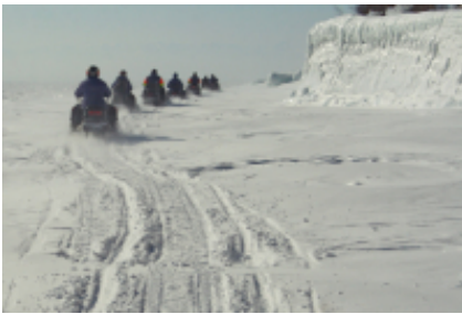
3 - Vydrino - Bolshiye Koty -