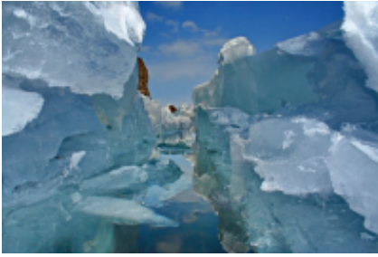
1 - Irkutsk - Listwjanka -