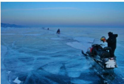
4 - Irkutsk - Irkutsk -