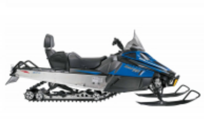
Bearcat XT + $0.00