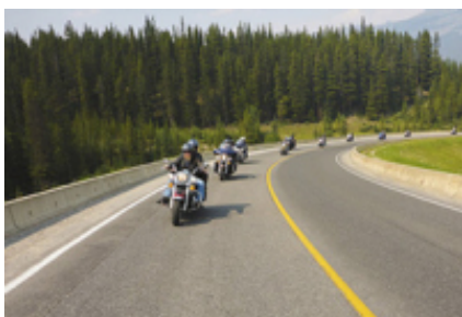
6 - Banff - Waterton Lakes National Park - 384 km