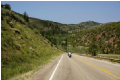
2 - Seattle - Winthrop - 376 km