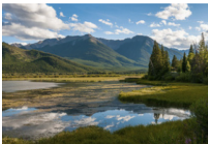
5 - Jasper - Banff - 347 km