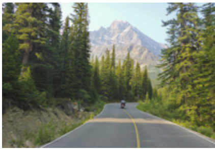
3 - Winthrop - Kamloops - 507 km