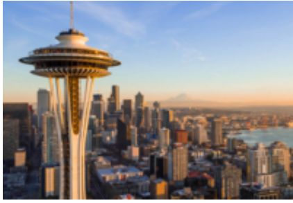
1 - - Seattle - 0 km