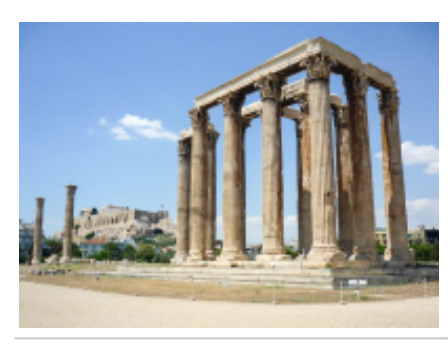
2 - Langadia - Olympia - 60