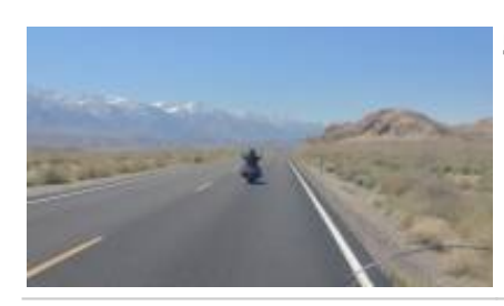
5 - Grand Canyon - Laughlin - 412 km