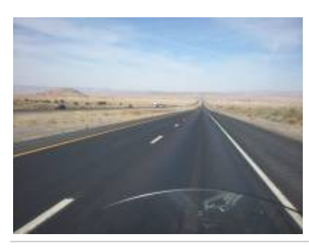
6 - Laughlin - Las Vegas - 206 km