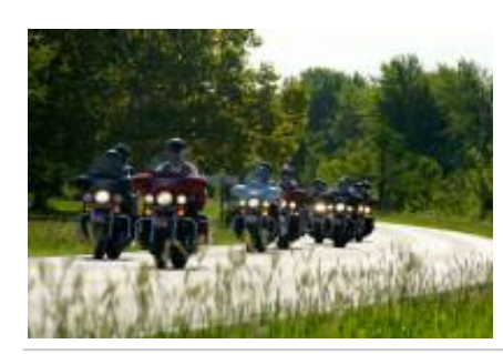
2 - Albuquerque - Santa Fe - 104 km