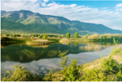
2 - Kerkini-See - Fort Roupel - 52