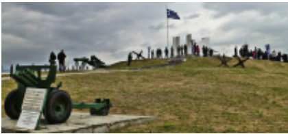
3 - Serres - Alistratis Cave Jeskyne - 63