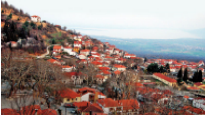
1 - GS Traveler Moto Rentals - Kerkini Lake National Park - 594