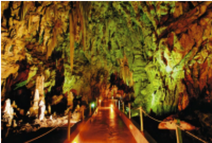
4 - Palaios Panteleimonas, Historical Mountain Village - GS Traveler Moto Rentals - 410