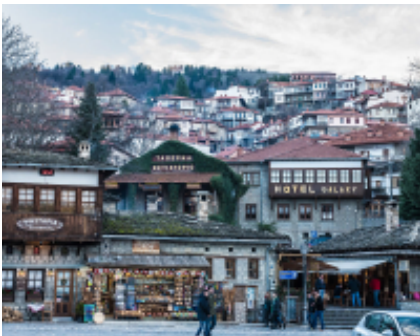
5 - Ioannina - Metsovo -