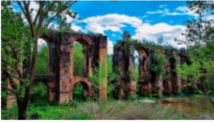
1 - GS Traveler Moto Rentals - Ioannina -