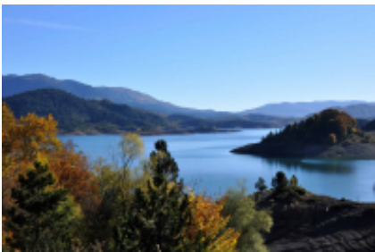
4 - Ioannina - Pindos National Park -