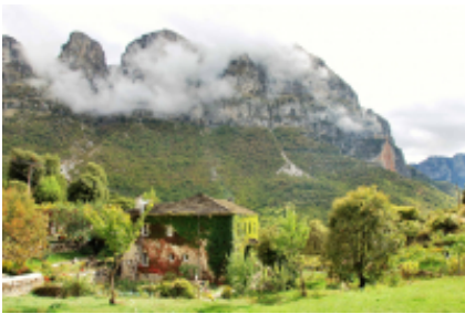
3 - Ioannina - Papingo -