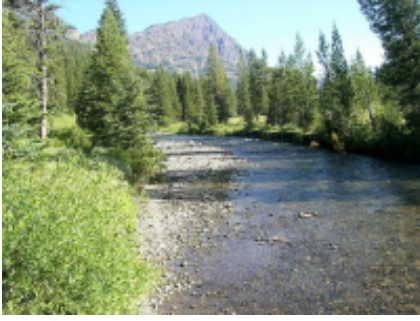
7 - Radium - Calgary - 309