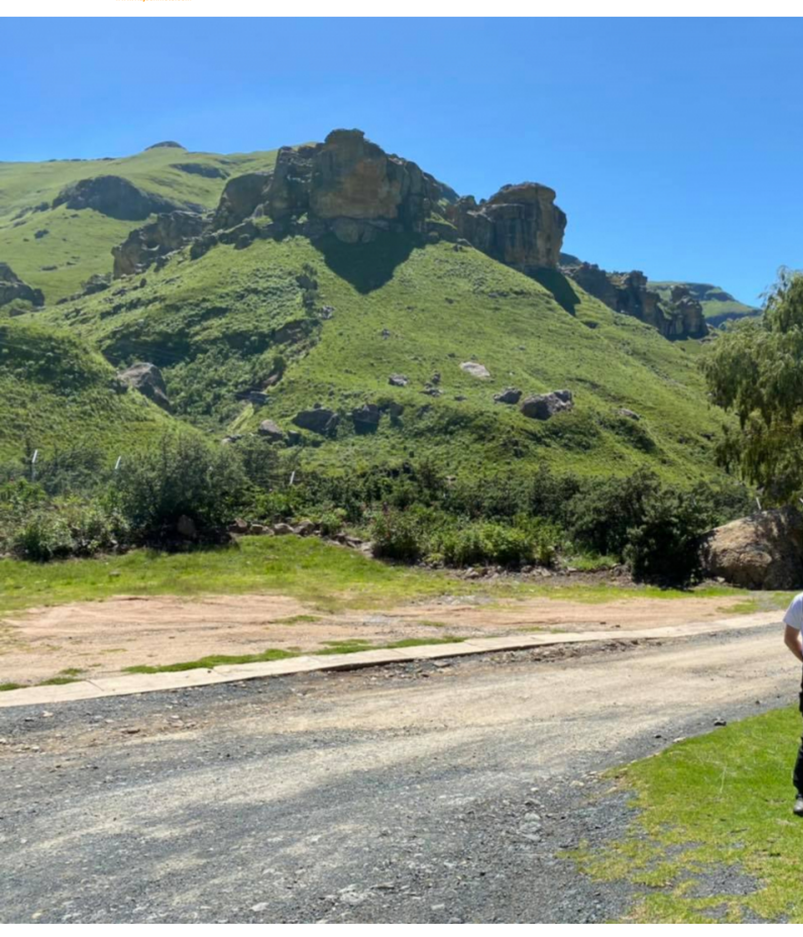
Motorcycle dual-purpose and Adventure Kingdom in the Sky. Lesotho The roof of Africa