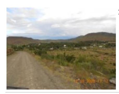
13 - Addo - Flughafen Port Elizabeth -