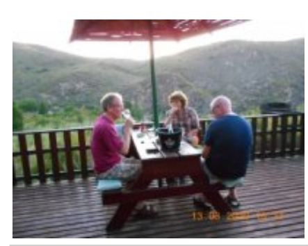
12 - New Bethesda - Addo -