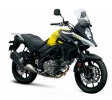
DL 650 V Strom + £0.00