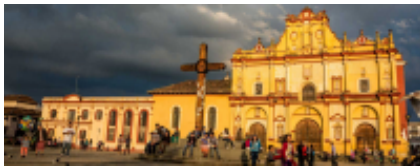
2 - Puebla - Coatzacoalcos - 471