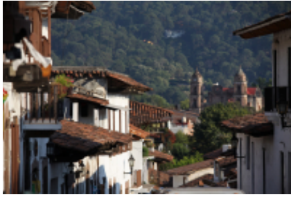
1 - Mexiko-Stadt - Puebla - 127