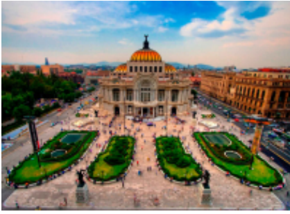
8 - Palenque - Orizaba - 275