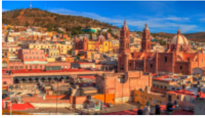
1 - Mexiko-Stadt - Valle del Bravo -