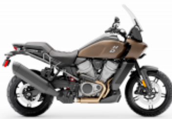
Pan America 1250 + $0.00