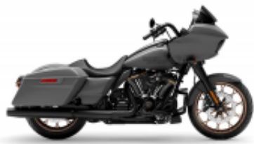
Street Touring Road Glide + $0.00