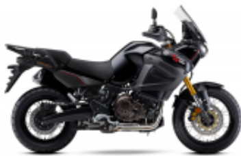
Super Tenere 1200 + $0.00