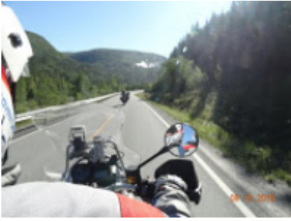
1 - Levi - Levi - 0