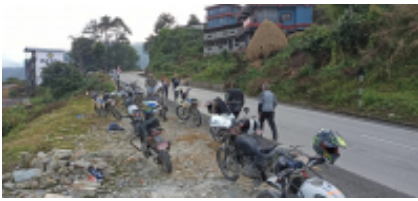
3 - Pokhara - Kalopani - 110