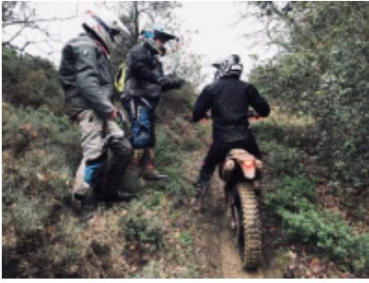
6 - Mystras - Kardamili - 130