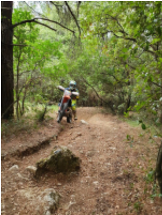
7 - Kardamili - Kardamili - 70