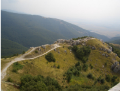
1 - Sofia - Sofia - 0