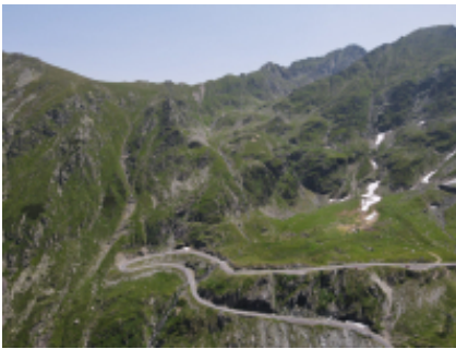
3 - Belogradtschik - Weliko Tarnowo - 400