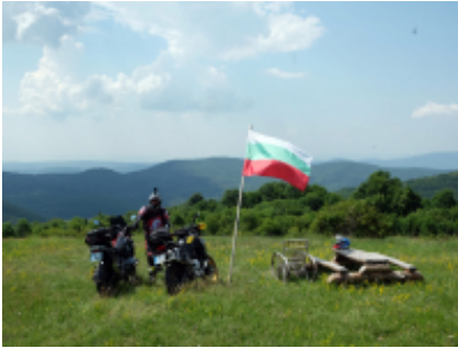
2 - Sofia - Belogradtschik - 240