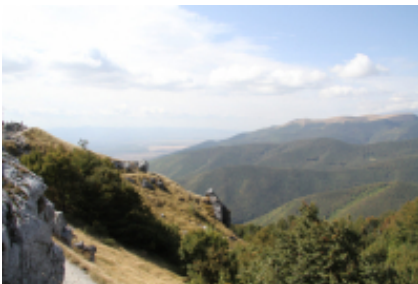
5 - Welingrad - Welingrad - 0