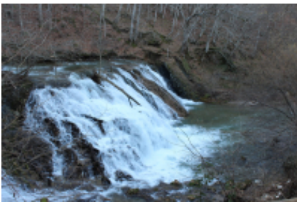
4 - Weliko Tarnowo - Welingrad - 340