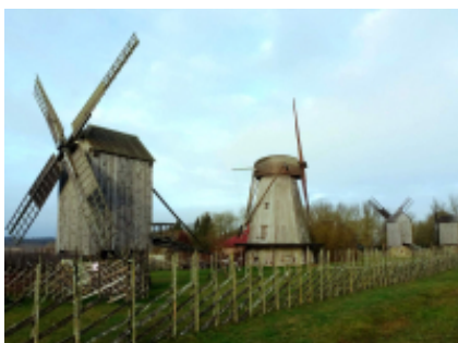
6 - Saaremaa - Arensburg - 51