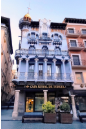
1 - Barcelona - Teruel - 0