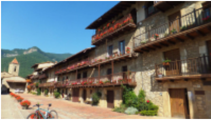
2 - Girona - Les Preses - 65