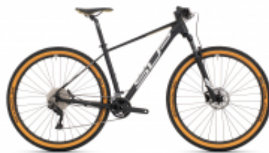
XC 879 + $15.70