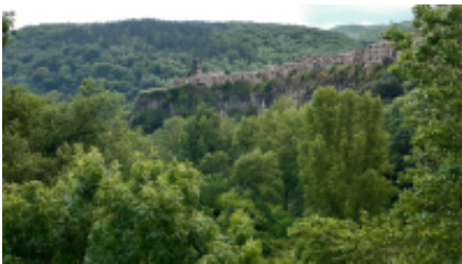
3 - Les Preses - Besalú - 60