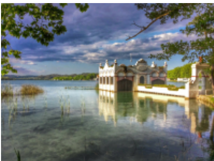
5 - Banyoles - Girona - 31