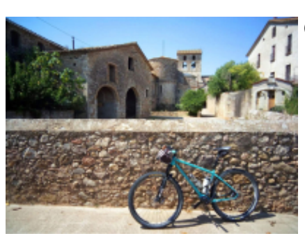
6 - Banyoles - Girona - 31