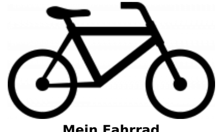
Mein Fahrrad + $0.00