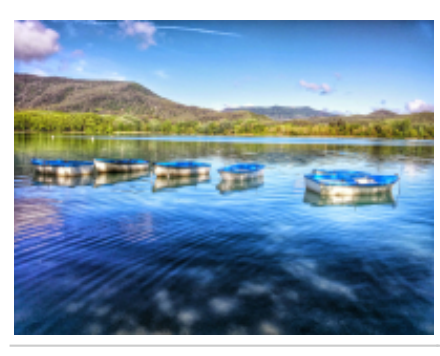
5 - Besalú - Banyoles - 36