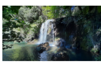
2 - Girona - Les Preses - 60