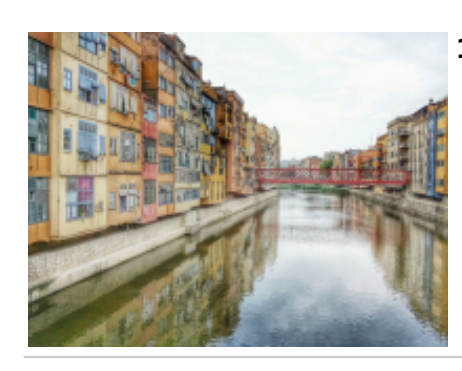
1 - Girona - Girona - 0