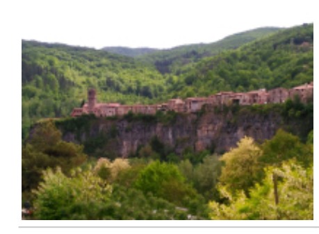
3 - Les Preses - Olot - 41