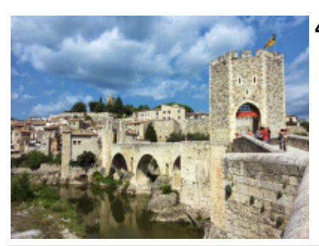
4 - Olot - Besalú - 44