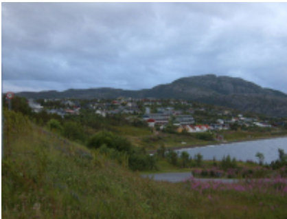
7 - Trondheim - Mosjøen - 400 km