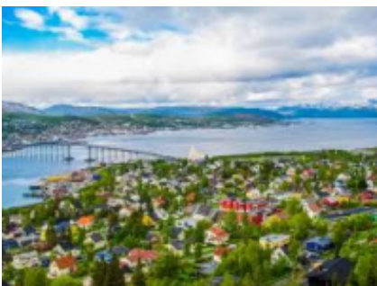
10 - Narvik - Alta - 470 km