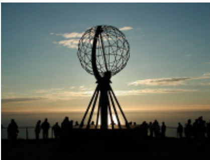
8 - Mosjøen - Narvik - 530 km