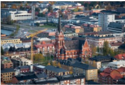
9 - Narvik - Narvik - 560 km