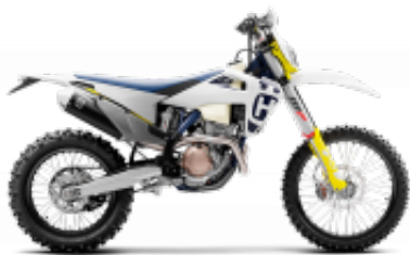
FE 350 + $0.00