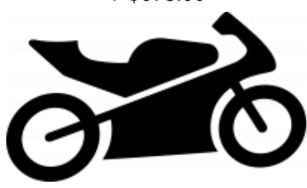
My own motorbike + $0.00