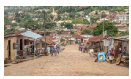
5 - Abomey - Atakpame - 150 km