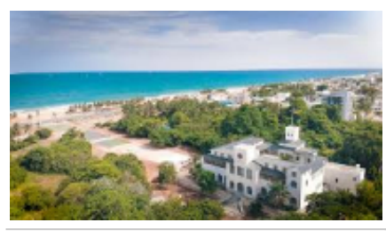
8 - Station Météorologique de Koumakonda - Lome - 180 km