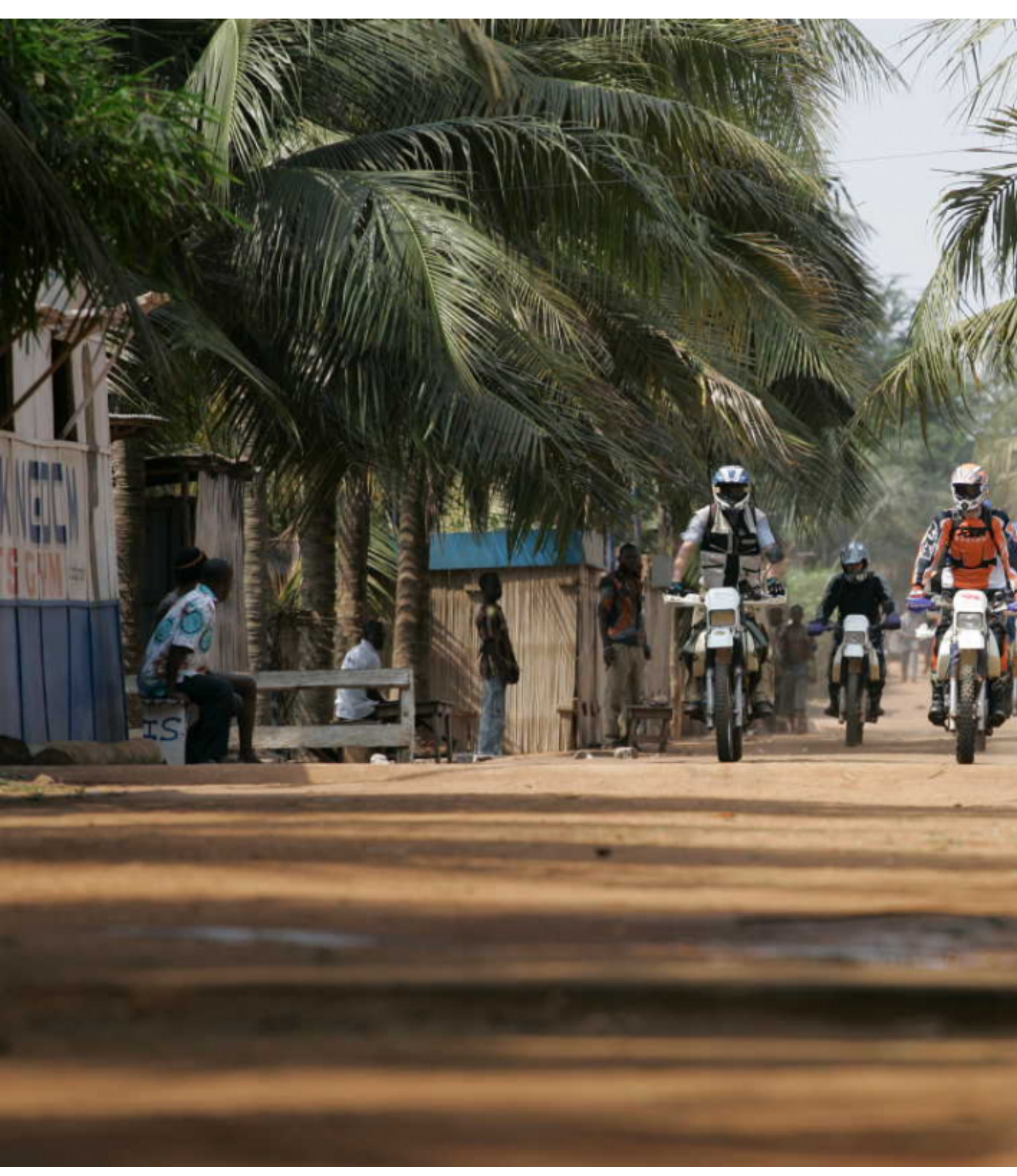
Motorcycle Enduro off Road tour, Togo & Benin Vaoudou traks