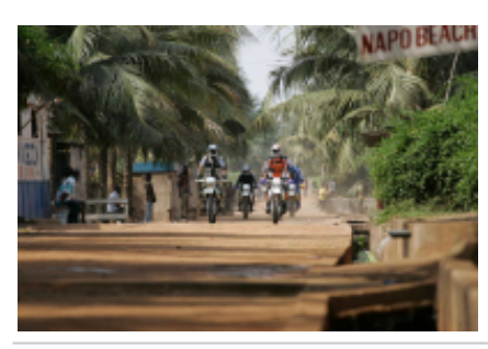
🎇 6 - Atakpame - Badou - 150 km