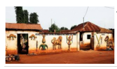
4 - Ouidah - Abomey - 170 km