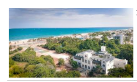
1 - - Lome - 0