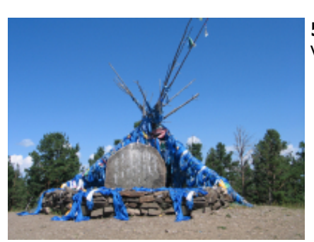
5 - Onon - Dundburd - Visit Dadal village, the place where Genghis Khan was born in 1162.