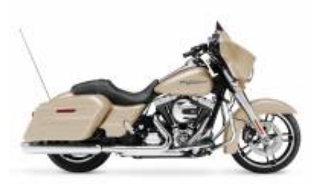
Street Glide Special + $700.00