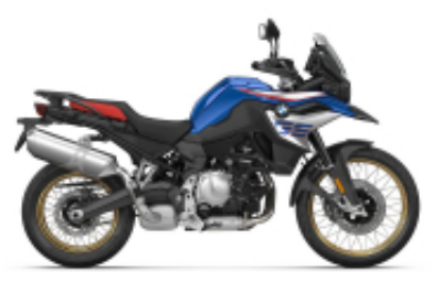
R 1250 GS LC F 850 GS + $131.22