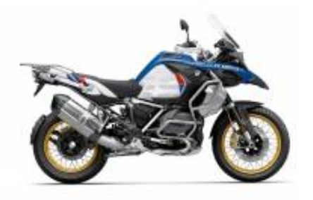
R 1250 GS Adv LC + $262.44