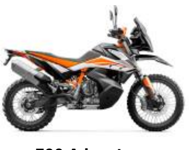
790 Adventure + $511.76