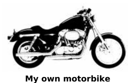
My own motorbike + $0.00