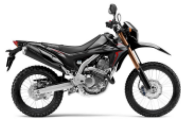
CRF 250 L + $712.37