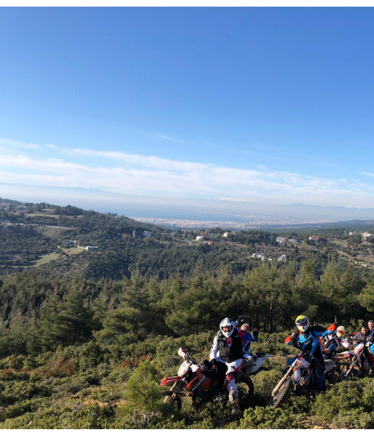
Motorcycle Enduro off Road tour standard Bulgaria