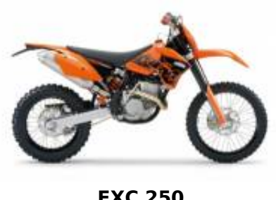
EXC 250 + $0.00