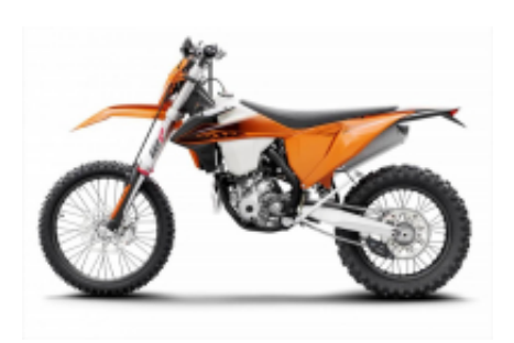
TPI/Six Days 300 + $0.00