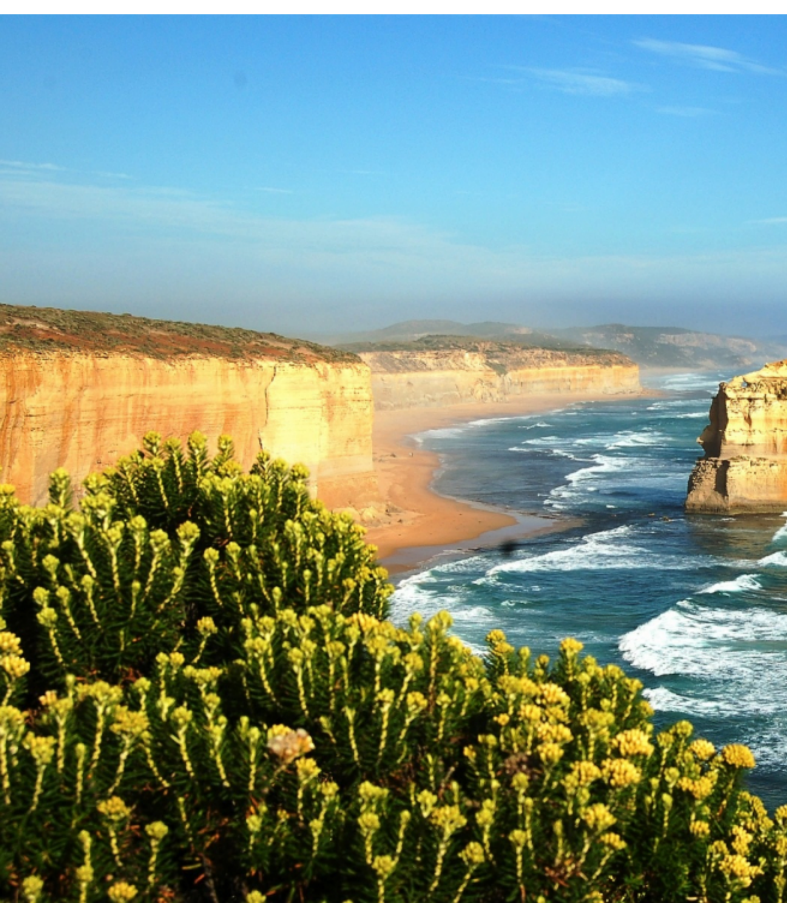
Motorcycle dual-purpose and Adventure Australia, from Melbourne to Brisbane self guided