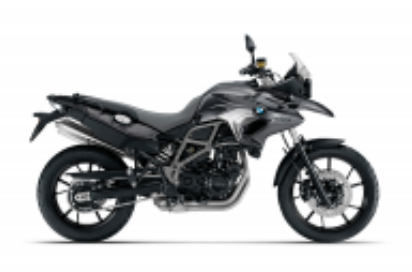
F 700 GS + $0.00