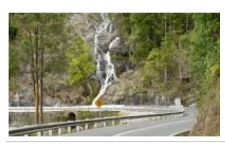
11 - Armidale - Waterfall Way -