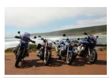
6 - Snowy Mountains - New South Wales -