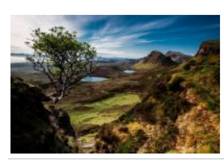
8 - Sydney - Blue Mountains -