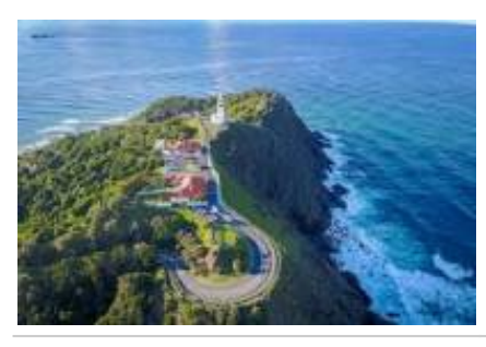
12 - Waterfall Way - Byron Bay -