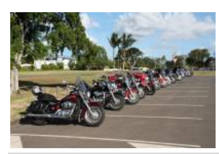
9 - Blue Mountains - Hunter Region -