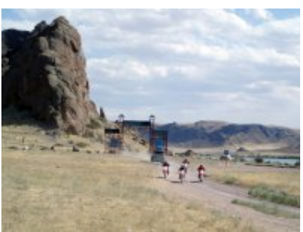
2 - - - The Judean Desert and the Dead Sea 2.000 years old cliff-hanging, desert canyon Monastery One of a kind views of Jerusalem from the desert Technical climbing down to the lowest place on Earth Swimming in the Dead Sea! A surprising freshwater spring visit Chillout night at a traditional Beduin "Khan" Desert Hosting