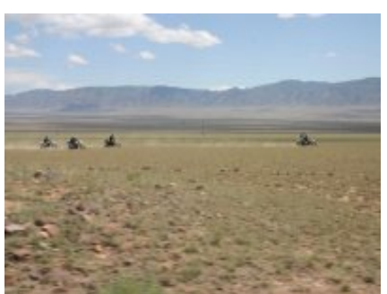
3 - - - Deep into the Bible Land Climbing the Copies Cliff and delve into the Judean Desert Breathtaking views from the Dead Sea Chillout night at a traditional Beduin "Khan" Desert Hosting