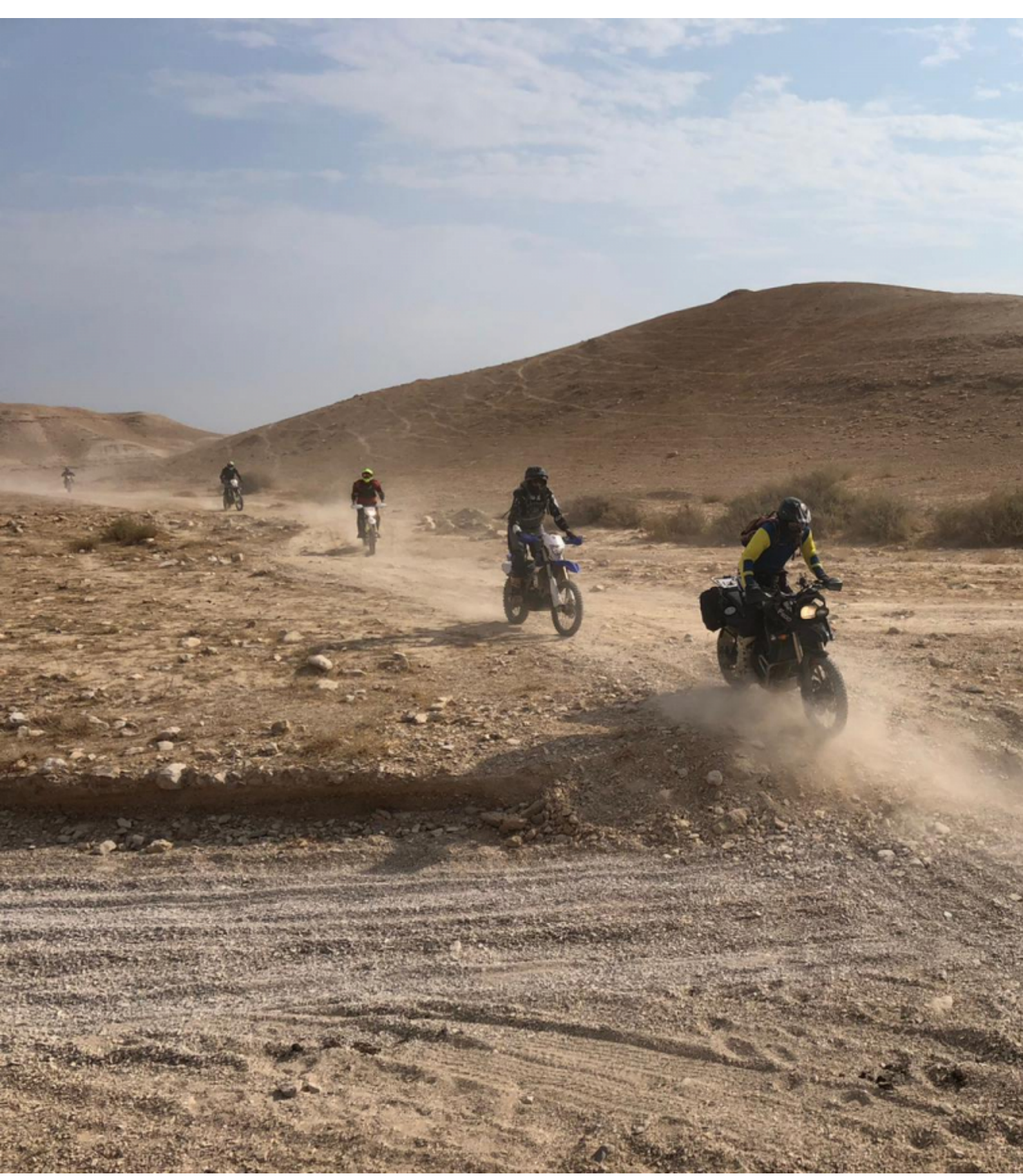
Motorcycle Enduro off Road tour deserts, craters and canyons of Israel