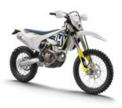
250 Enduro + $0.00