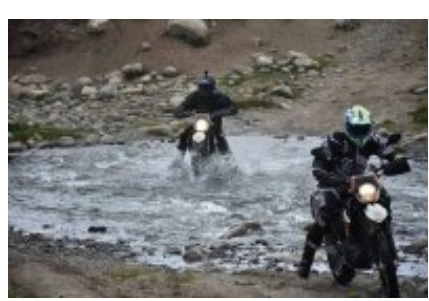
Deep canyons ride Sunrise coffee from the Ramon Crater Crater Sliding Water Oasis Egyptian border ride Grand rivers reserve ride Deep canyons ride