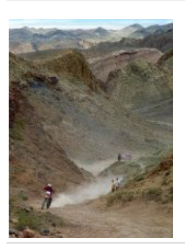
4 - - The spectacular Ramon Crater Desert Enduro ride through deep narrow canyons Ramon Crater views from above and cliff ride Chillout night at a traditional Beduin "Khan" Desert Hosting