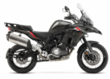
TRK 502 X + $0.00