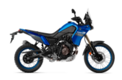
Tenere 700 + $66.36