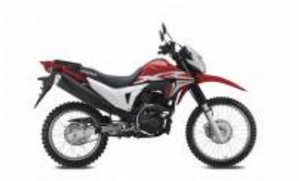
XR 190 + 0,00 €