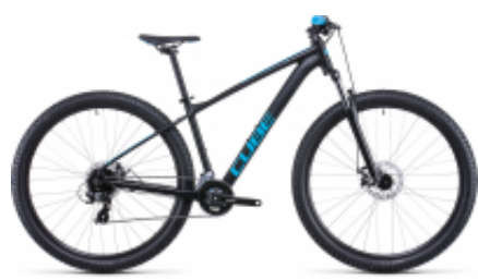
AIM 29er + $181.59