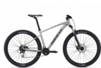
Talon 2 29 + $181.59