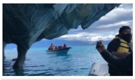
11 - Puerto Natales - Punta Arenas - 248

We will head towards Chile, completing the final stretches of gravel roads on Route 40. We will cross the Cancha Carrera Border Crossing. If weather permits, we will visit the impressive Torres del Paine National Park (*), encountering its ñandús and guanacos, before continuing to the hotel in Puerto Natales, where we will enjoy our farewell dinner for those who are only doing the Patagonia portion.