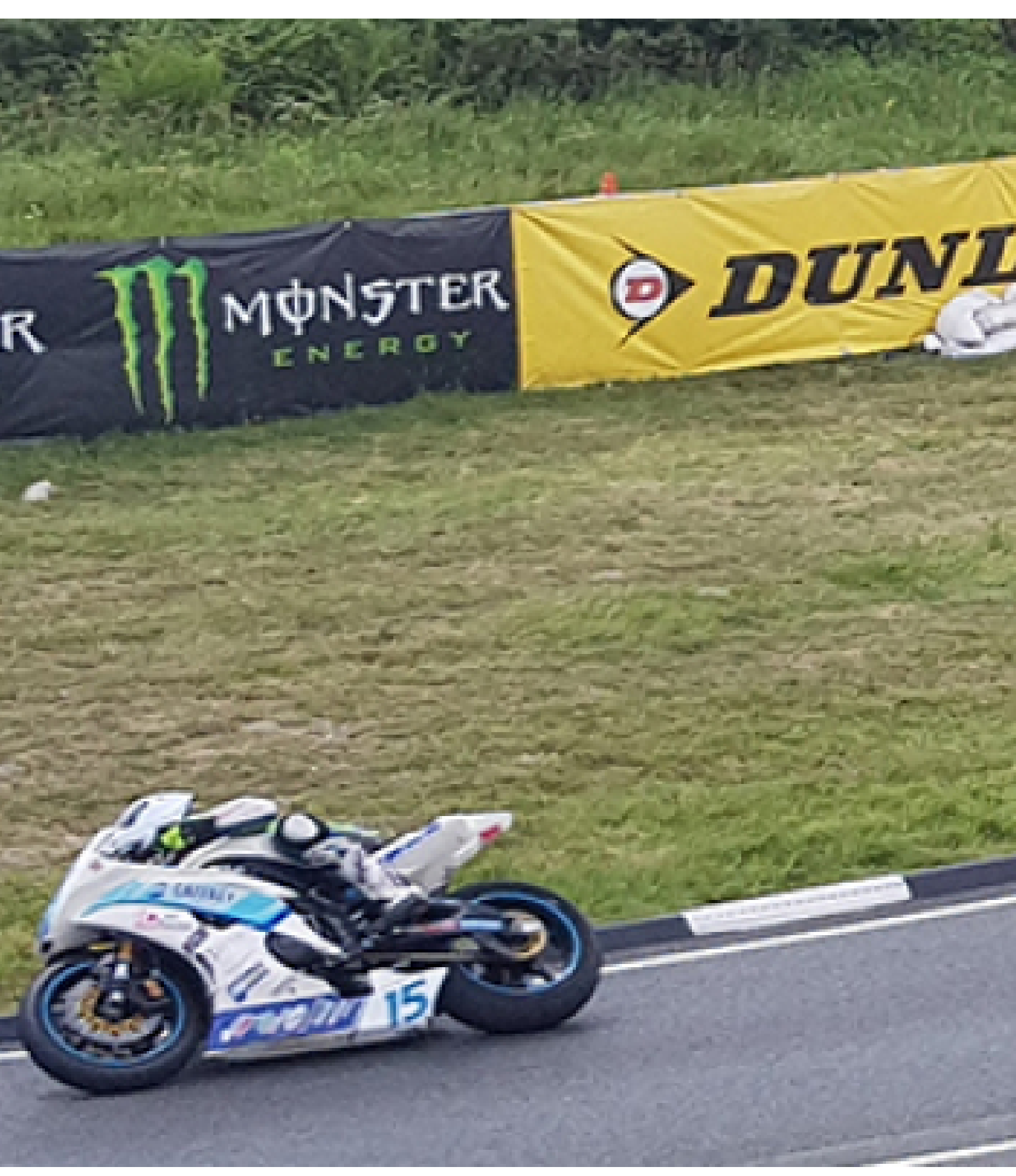
Voyage en moto Île de Man TT 2024, de Liverpool, option hôtel