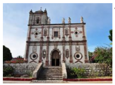
4 - Cataviña - San Ignacio - 613