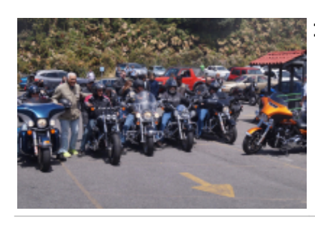
15 - Los Angeles - - 0 km