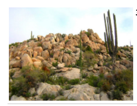
3 - Ensenada - Cataviña - 370