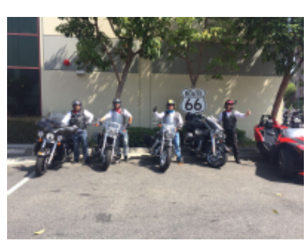
6 - Loreto - La Paz - 360