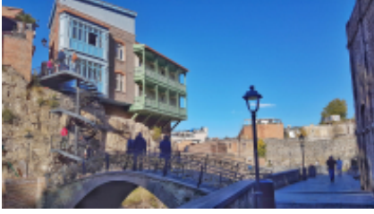
1 - Tbilissi - -