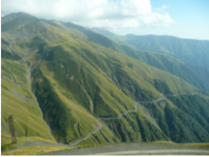
2 - Tbilissi - Mtskheta - 125