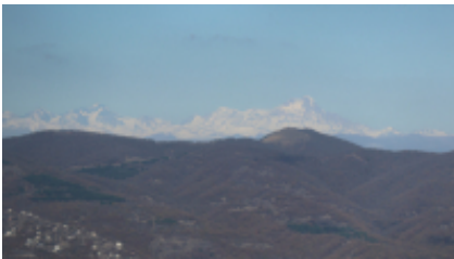
4 - Omalo - Omalo - 60-80