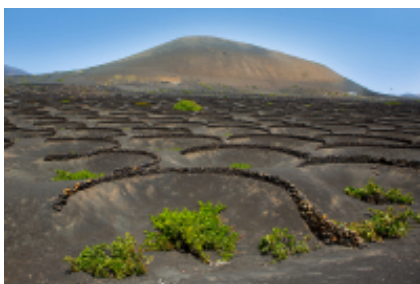
5 - Lanzarote - Lanzarote -