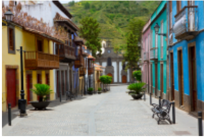
1 - la Grande Canarie - - 0