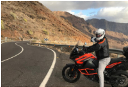
2 - la Grande Canarie - Fuerteventura - 250