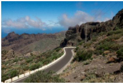
3 - Morro Jable - Corralejo - 250