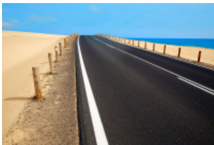
4 - Corralejo - - 0