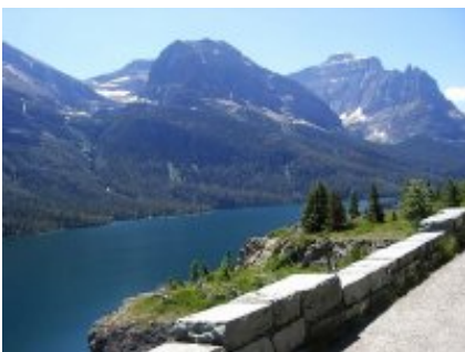
5 - Kelowna - Kelowna - 0