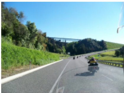
4 - Nelson - Kelowna - 392