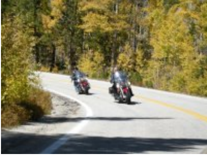
1 - Aéroport - Calgary - 25