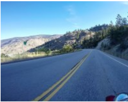
3 - Waterton - Nelson - 269