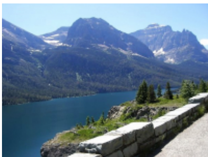
5 - Kelowna - Kelowna - 0