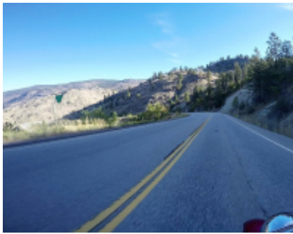
3 - Waterton - Nelson - 269