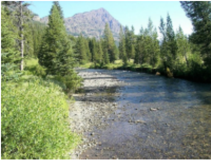
7 - Radium - Calgary - 309