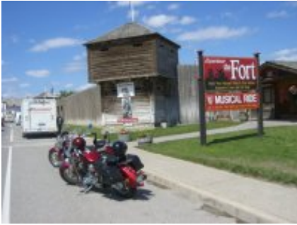
2 - Calgary - Waterton - 430