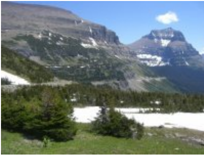
8 - Calgary - Aéroport - 0