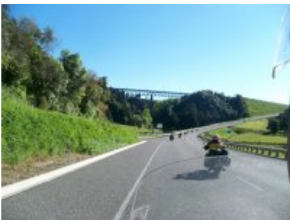
4 - Nelson - Kelowna - 392