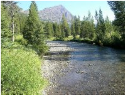
7 - Radium - Calgary - 309