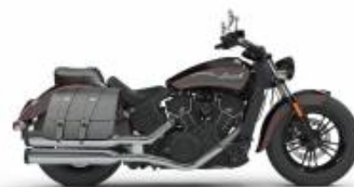
Scout Sixty + $700.00