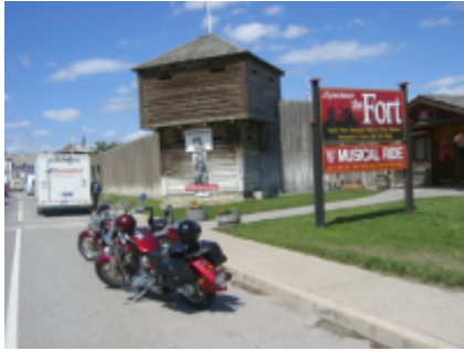
2 - Calgary - Waterton - 430