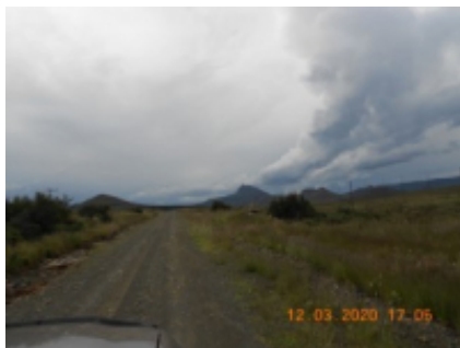
12 - Nieu-Bethesda - Addo -