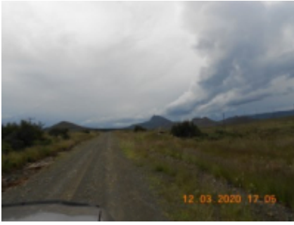
12 - Nieu-Bethesda - Addo -