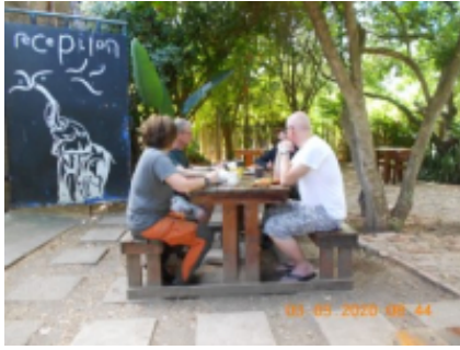
1 - Port Elizabeth - Addo -