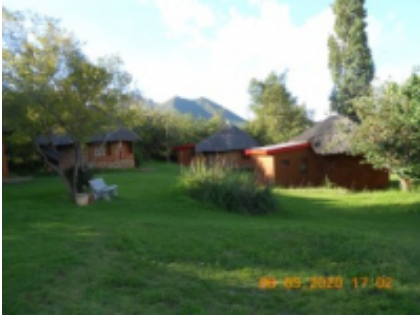
9 - Malealea - Semonkong -