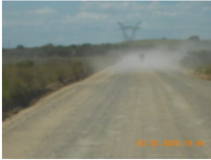
2 - Addo - Hogsback -