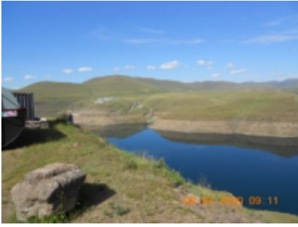
7 - Lejone - Malealea -