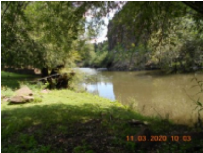
9 - Malealea - Semonkong -