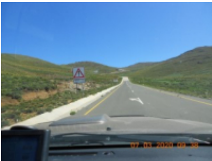
11 - Bethel - Nieu-Bethesda -