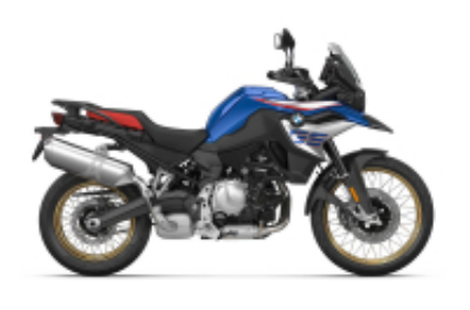
F 850 GS + $66.36