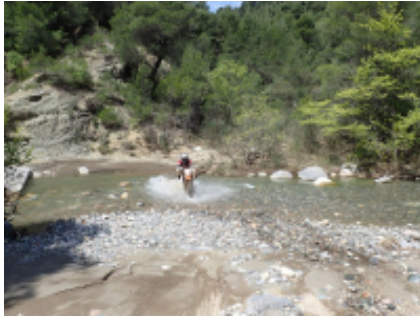
1 - Athènes - Athènes - 0